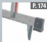
P. 174 Set of foot pikes for cross-beams