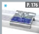
* P. 176 Clamp fitting set for stairway adjustment