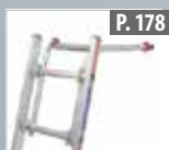
P. 178 Telescopic wall spacer for rung ladders