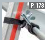
P. 178 Ladder holder set for gutters