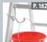
P. 182 Bucket hook for rung ladders