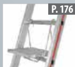
P. 176 Folding universal ladder step